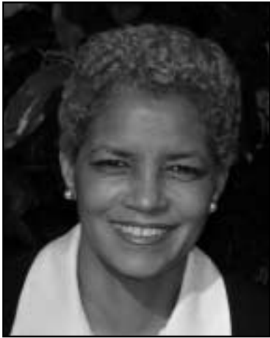
ATLANTA Hon. Shirley Franklin Mayor, City of Atlanta