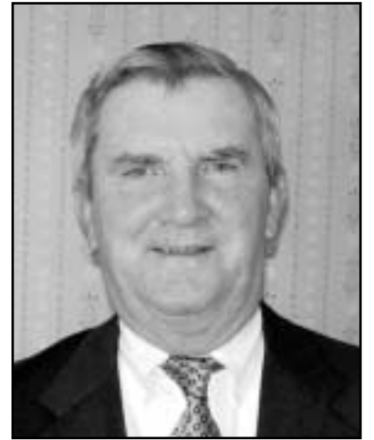
FAYETTE COUNTY Hon. Ken Steele Mayor, City of Fayetteville