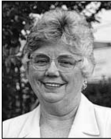
CHEROKEE COUNTY Hon. Marguerite Cline Mayor, City of Waleska